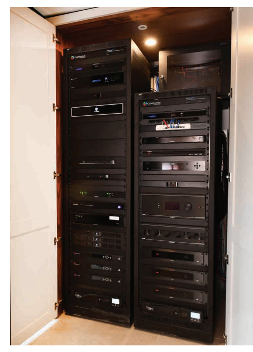
Dedicated AV racks keep equipment out of the living spaces.

The cinema's air conditioning and circulation system—required to overcome the lack of natural ventilation—has a purge cycle that automatically refreshes the room after use.