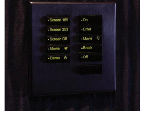
Lutron wallplate allows quick access to main cinema controls.

The cinema's Lutron lighting is integrated into the home's Savant Pro control system. As soon as video content starts to play, the lights automatically dim, leaving low-level illumination from the stair lights (except during daytime viewing).