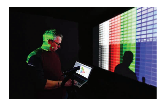
The projector was ISF calibrated for optimum picture quality.

The tiered seating Cyberhomes designed and built gives everybody in the room an unrestricted view. People in the front row get an extra level of luxury as they can stretch out and relax in the comfy loungers.