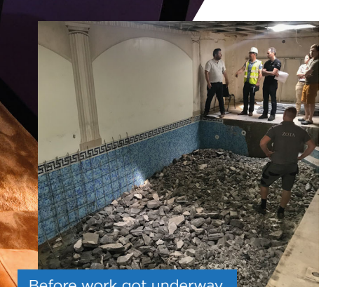
Before work got underway

All these entertainment options are served up by the Epson projector carefully installed just behind the rear row of cinema seating. Power is nothing without control and this space enjoys the attention of AV specialist Anthem with an MRX1140 processor.