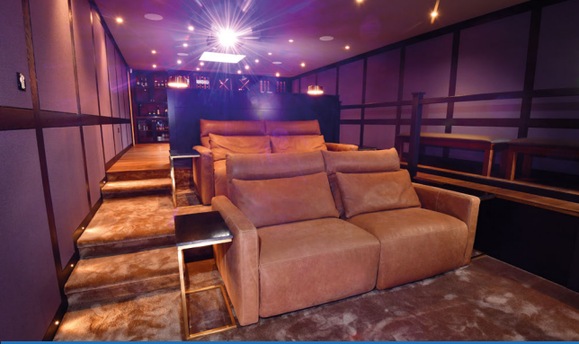
The speakers are woven into the space hidden behind the panels that make up the walls of the cinema.