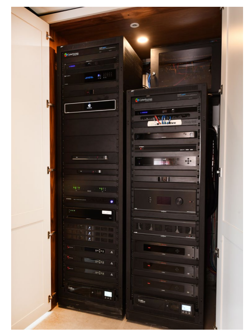
Dedicated AV racks keep equipment out of the living spaces.

The cinema's air conditioning and circulation system—required to overcome the lack of natural ventilation—has a purge cycle that automatically refreshes the room after use.