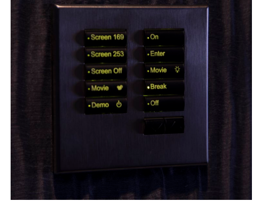
Lutron wallplate allows quick access to main cinema controls.

The cinema's Lutron lighting is integrated into the home's Savant Pro control system. As soon as video content starts to play, the lights automatically dim, leaving low-level illumination from the stair lights (except during daytime viewing).