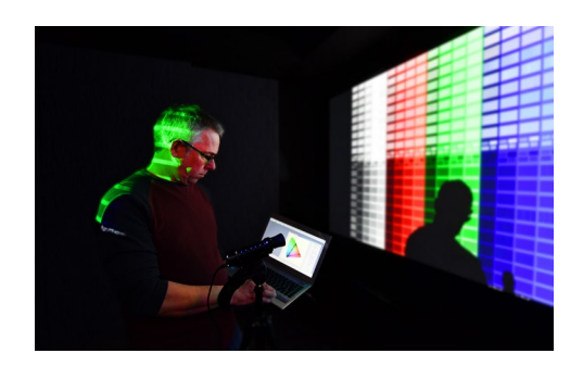
The projector was ISF calibrated for optimum picture quality.

The tiered seating Cyberhomes designed and built gives everybody in the room an unrestricted view. People in the front row get an extra level of luxury as they can stretch out and relax in the comfy loungers.