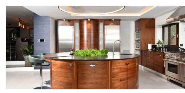
Large open plan entertaining space.

The owner had already planned the next phase of the redevelopment, which includes a swimming-pool complex. So Cyberhomes future-proofed the automation system, pre-wiring it for new features to be added further down the line