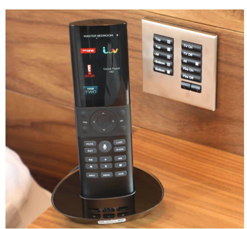
Custom-engraved Lutron wallplates provide control in addition to Savant Pro remotes and touch screens.

And the family never need miss a delivery or visitor again, as the doorbell is integrated into the home's audio system. The bell chimes throughout the house, and any audio playing anywhere in the house temporarily pauses. The family can instantly see who's calling on the gate's video intercom, which is integrated into the Savant Pro system.