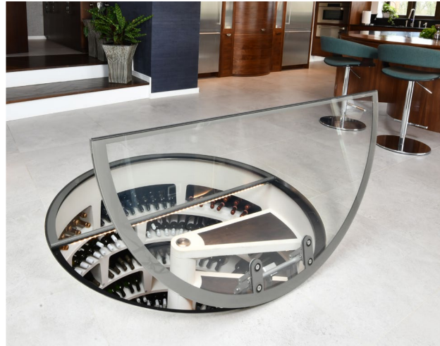
Our bespoke programming restricts who can access the wine cellar.

The air conditioning in the cinema—required to overcome the lack of natural ventilation—has a purge cycle that automatically refreshes the room after use.