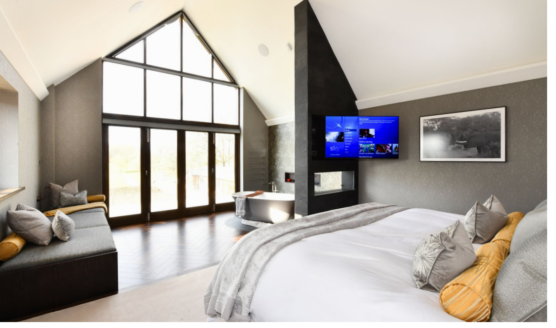
TV rotates into view when in use and custom motorised blinds can create complete blackout when required.