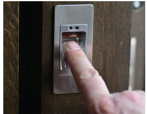
Fingerprint access control ensures the home is always secure, without the need for keys.

Built-in fingerprint readers do away with the need for keys, and can provide lock status updates.