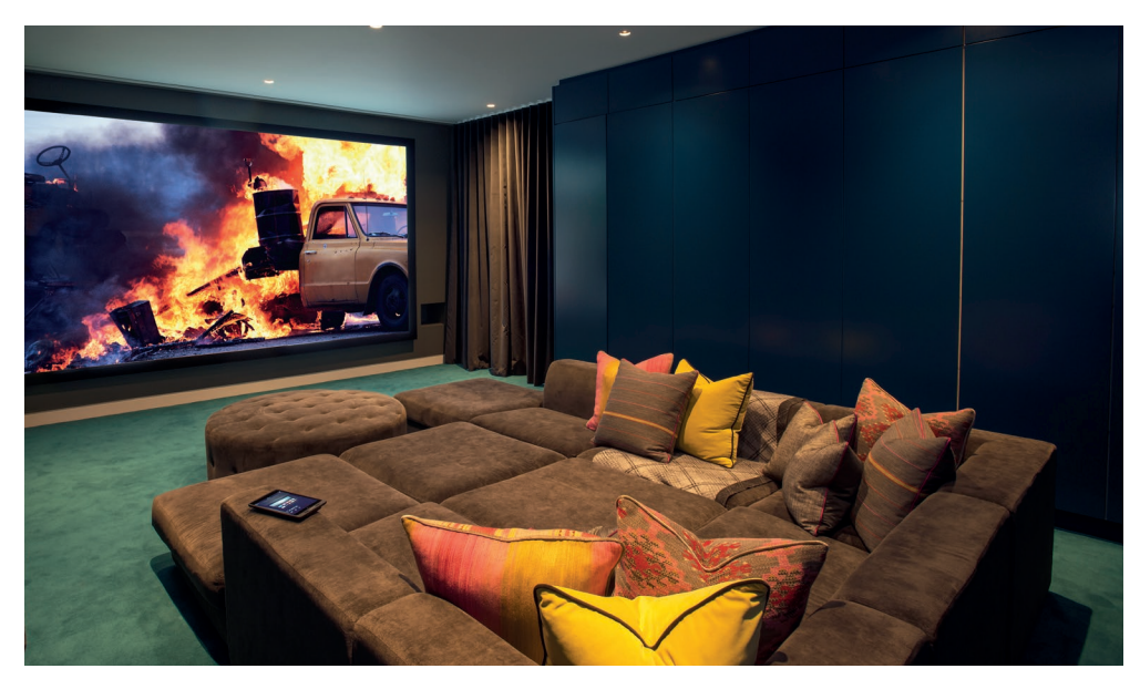
The basement cinema room is popular for every day TV watching, as well as big movie nights.