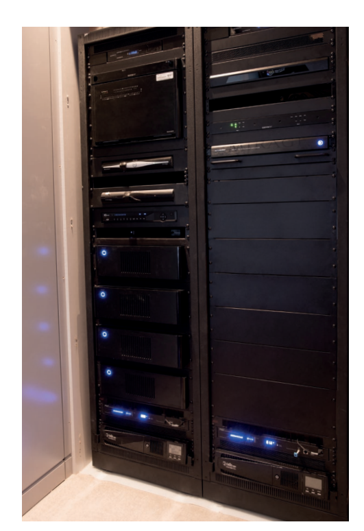
Two full height AV racks house all the centralised AV equipment with capacity for expansion.

Cyberhomes had worked successfully with the developer on several previous residential projects. But this one was personal.