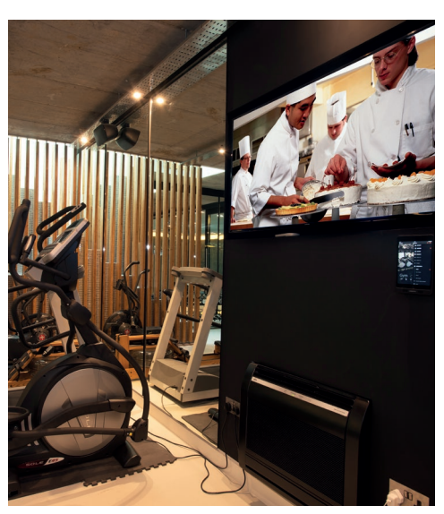
Wall-mounted iPads ensure the control system is always readily to hand.