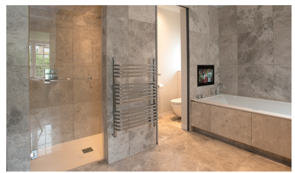
A waterproof TV is set into the luxurious marble of the ensuite bathroom.

and two Apple TV boxes via a Savant video matrix. Cyberhomes also installed a Savant cardframe system, so that new video sources can be easily incorporated in the future.