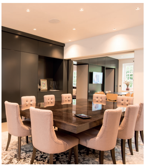
Lutron lighting control allows quick selection of the desired lighting scene.

Outdoor lighting is tuned to an astronomic schedule, switching on as dusk approaches, and off again in the early hours when everyone is likely to be in bed.