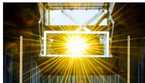
Sony 4K projector is bright enough for the most demanding of movies.