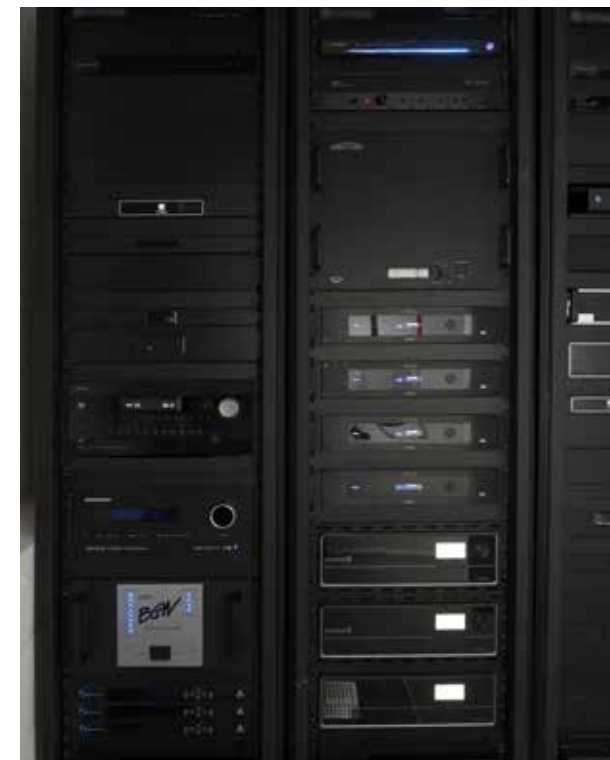
All equipment is installed in dedicated AV racks in the plant room, minimising the technology's impact on the home's interior design

When the screen isn't in use, the immaculate interior is preserved by hiding the equipment from view. The projector disappears into the ceiling, and the screen becomes invisible thanks to full closure side-masking. The speakers and acoustic