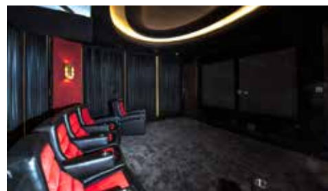
Full closure masking protects the screen when not in use.